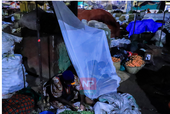
Women traders sleeping in markets in Uganda