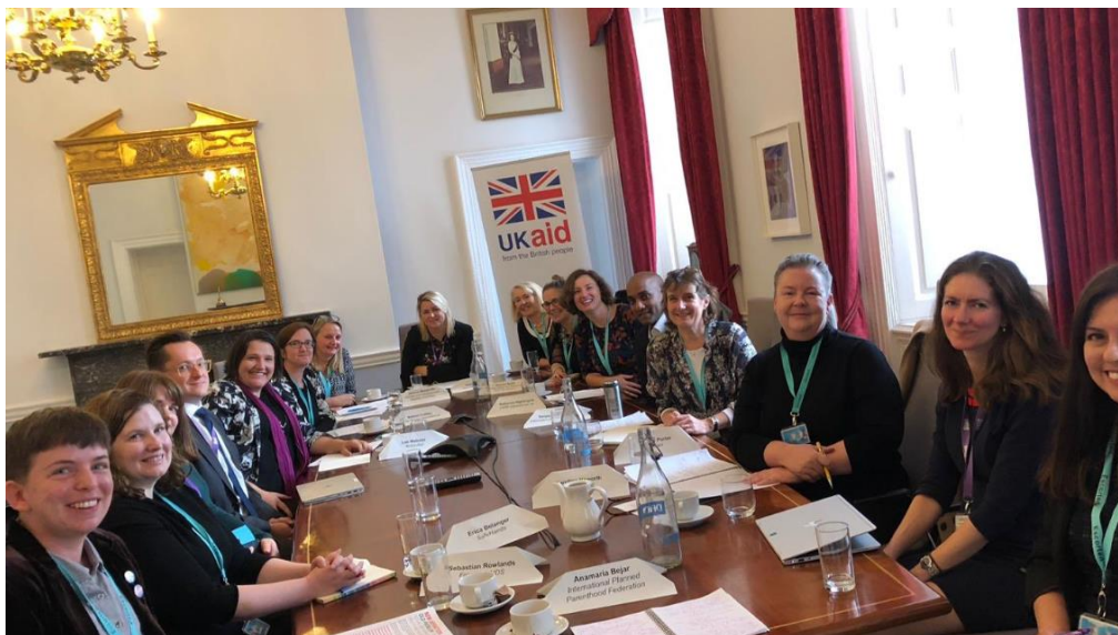
GADN member organisations join with the SRHR Network and GAPS to meet Baroness Sugg soon after she becomes a DFID Minister