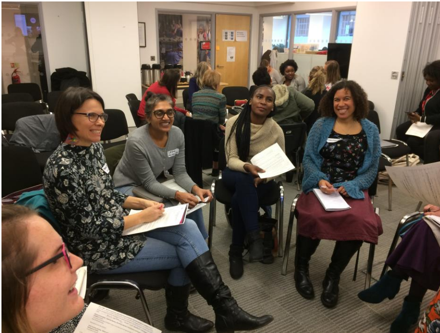
GADN members attend a members meeting on navigating the process of the approaching Beijing Women's Conference in November 2019