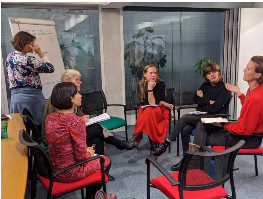
GADN members at a member's meeting on preventing sexual exploitation, abuse and harassment

Women of Colour Forum is a new initiative that GADN is pleased to support as part of its commitment to a more critical understanding of race, post-coloniality and intersectionality within international development discourse and practice. Recognising that women of colour need their own spaces to gather, free from the marginalisation and discrimination so often found in places of work and across British society more broadly, this forum is for women of colour only.